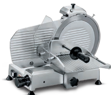
MIRRA 275 C VERT.