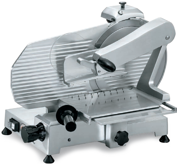
MIRRA 300 VERT. BS